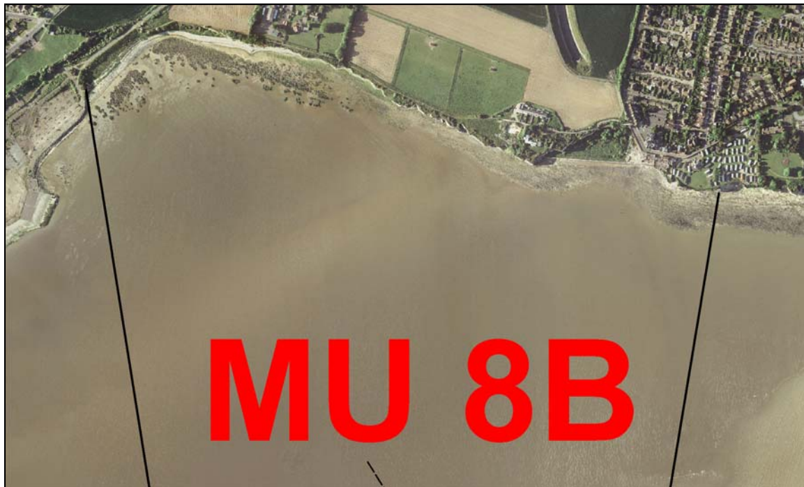
Figure 1: Management Unit 8B (Pegwell Bay)